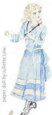
paper doll by Juliette Low