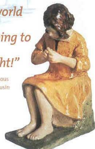
sculpture by Juliette Low